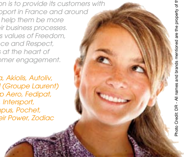
All names and brands mentioned are the property of their authors

References: Actia, Akiolis, Autoliv, Bricodeal, CapVI (Groupe Laurent) Carwall, EFL, Equip Aero, Fedipat, Joseph, Manitou, Intersport, Neuhauser, Olympus, Pochet, Poma, Siplast, Weir Power, Zodiac Aerospace, etc.