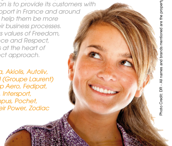
All names and brands mentioned are the property of their authors

References: Actia, Akiolis, Autoliv, Bricodeal, CapVI (Groupe Laurent) Carwall, EFI, Equip Aero, Fedipat, Joseph, Manitou, Intersport, Neuhauser, Olympus, Pochet, Poma, Siplast, Weir Power, Zodiac Aerospace, etc.